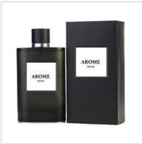
Mens Oud Perfume