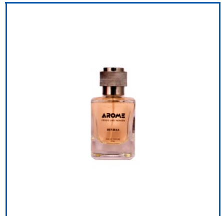
BINDAS PERFUME SPRAY