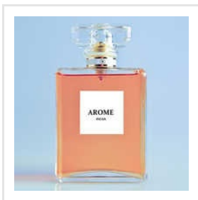
Ruh Khus Perfume