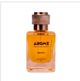
Armome Broot Spray Perfume