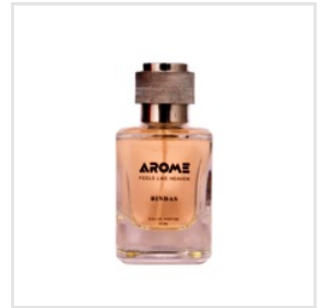
Bindas Perfume Spray