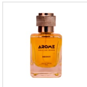
Broot Perfume Spray