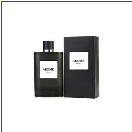
MENS OUD PERFUME

Agarbatti Fragrances, Armome Broot Spray Perfume, Bindas Perfume Spray, Black Ice Perfumes, Blue Lotus Perfume, Broot Perfume Spray, Choco Musk Perfume, Cool Water Perfume, First Rain Drope Perfume, Mens Oud Perfume, Musk Perfume, Rose Water, Ruh Gulab Mens Perfume, Ruh Khus Perfume, Saffron Perfume, etc.