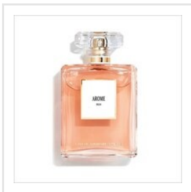
Ruh Gulab Mens Perfume