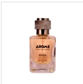
Choco Musk Perfume