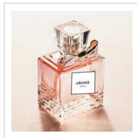
First Rain Drope Perfume