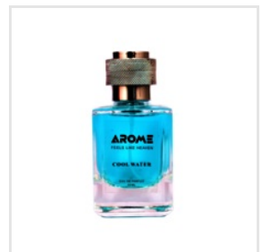
Cool Water Perfume